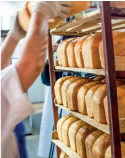
Food and beverage factories