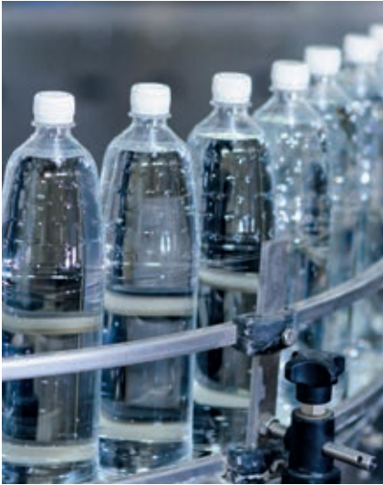
Bottling, filling & packaging plants

Our connectors are utilised in many industrial food and drink processing applications, including: